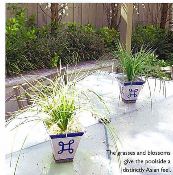
The grasses and blossoms give the poolside a distinctly Asian feel.