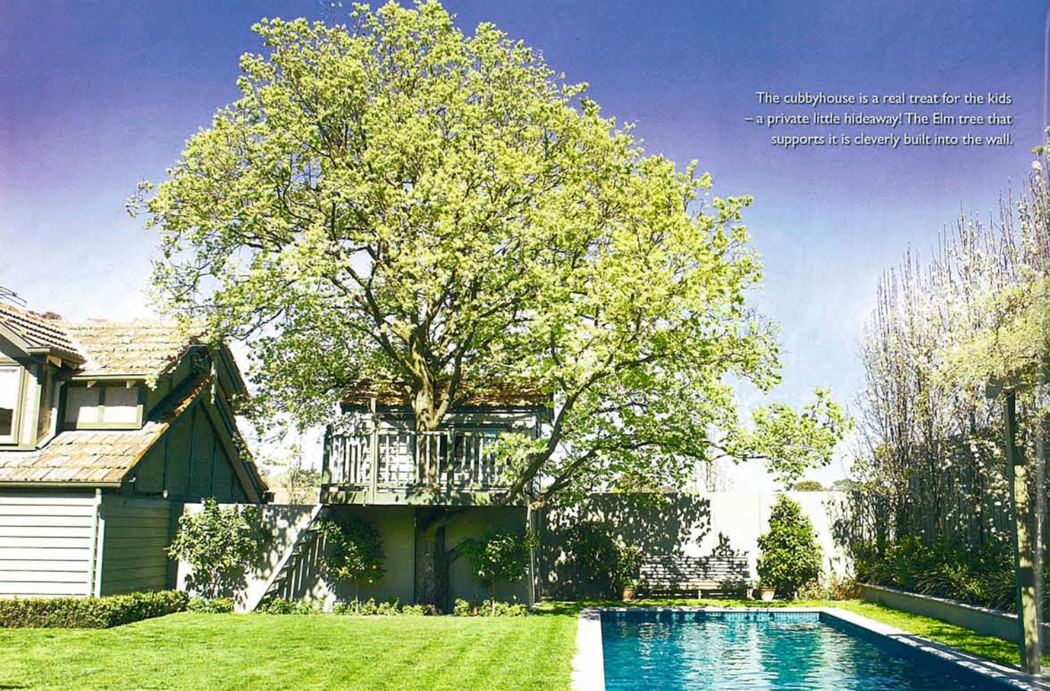
The cubbyhouse is a real treat for the kids – a private little hideaway! The Elm tree that supports it is cleverly built into the wall.