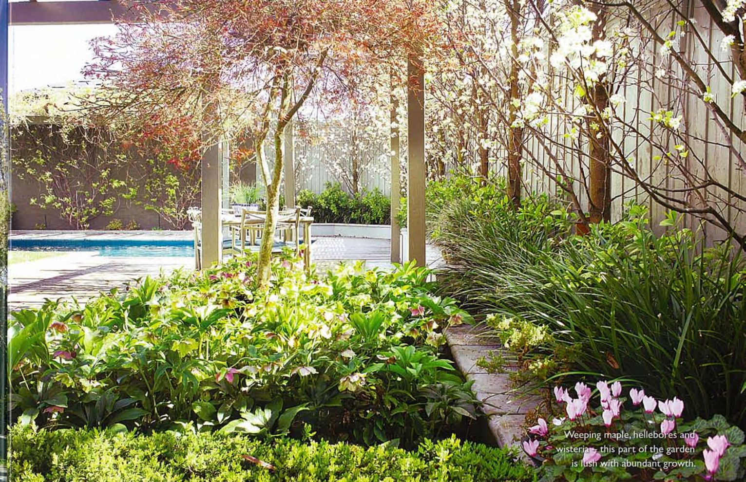
Weeping maple, hellebores and wisteria – this part of the garden is lush with abundant growth.